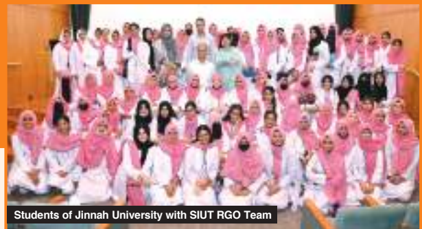
Students of Jinnah University with SIUT RGO Team

At SIUT, we recognize and highly value the significance of providing students with hands-on experience in a hospital setting. The purpose of this visit was to offer the students a profound understanding of the inner workings of our hospital and to contribute to their academic growth. ■