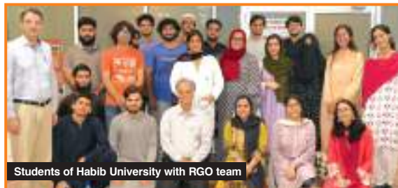
Students of Habib University with RGO team

The visit provided ample time for the students to explore the different departments and interact with medical experts at SIUT. ■