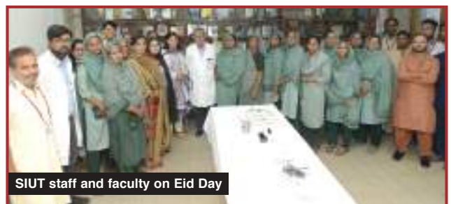
SIUT staff and faculty on Eid Day

With the blessings of Eid, let us renew our commitment to serving humanity and providing world-class healthcare to those in need. May this Eid bring happiness, peace, and good health to all. ■