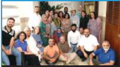
Students featured in the photo along with Centre of Biomedical Ethics and Culture, SIUT faculty are represented from various institutes across the city and country.