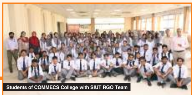
Students of COMMECS College with SIUT RGO Team