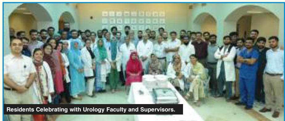
Residents Celebrating with Urology Faculty and Supervisors.

C ongratulations to FCPS Urology residents who passed the July Examination. A great achievement as of the 11 who took the Exam 8 passed with flying colours. Good luck to the Candidates and praise for the Superiors who trained them. SIUT is a center for Urology training where doctors come from all over Pakistan and currently 69 doctors are under training for FCPS Urology. ■