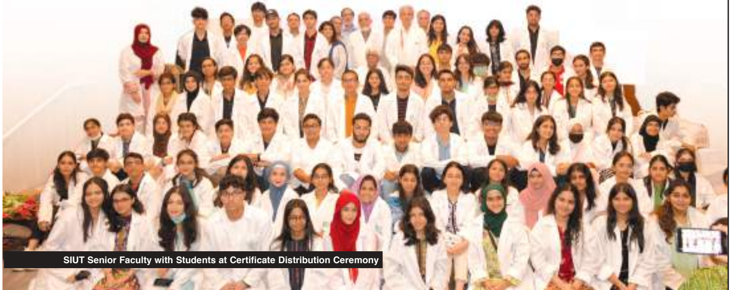
SIUT Senior Faculty with Students at Certificate Distribution Ceremony

principle of community service was based on empathy, compassion and dedication to serve selflessly. This program helps the young generation to see first-hand the medical problems of the disfranchised who cannot afford treatment and will infuse in them a spirit of help and care for fellow human beings. ■