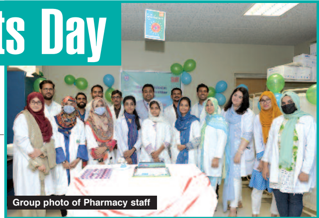
Group photo of Pharmacy staff