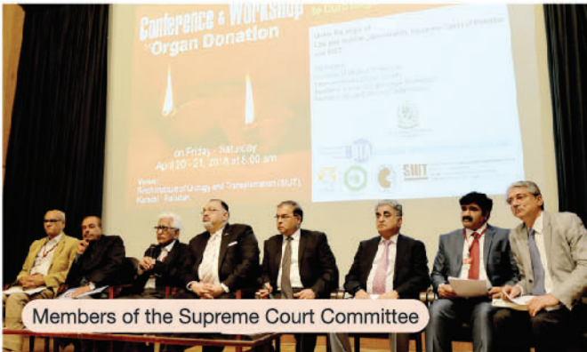
Members of the Supreme Court Committee

A three judge bench of the Supreme Court of Pakistan headed by the Chief Justice Mian Saqib Nisar appointed a committee under the aegis of the Law and Justice Commission of Pakistan to organize a workshop and conference involving all stake holders to address the issues of illegal transplants and deceased organ donation and give recommendations.