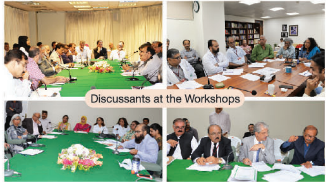
Discussants at the Workshops