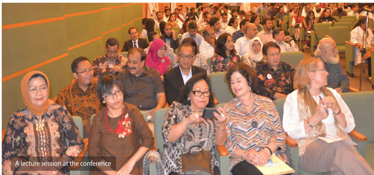
A lecture session at the conference

CBEC hosted an international conference in collaboration with Indonesia's Centre for Bioethics and Medical Humanities (CBMH) in April 18 - 20, 2017. Spread over two and a half days, conference sessions included formal talks, teaching sessions and workshops. The event was the second combined academic activity by the bioethics centres of Pakistan and Indonesia, the first collaborative event being a workshop hosted by CBMH in Yogyakarta, Indonesia, in October, 2016.