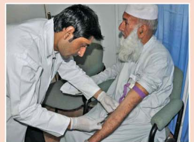
Blood collection for screening.

This year the theme was "Kidneys for Life - Stop Acute Kidney Injury".