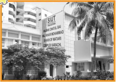
Hajiani Chatul Bai Medical Centre Garden East, Karachi, SINDH No. of Patents treated 20,000