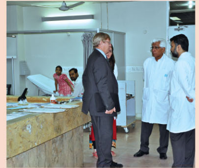
Visit to Paediatric Nephrology OPD