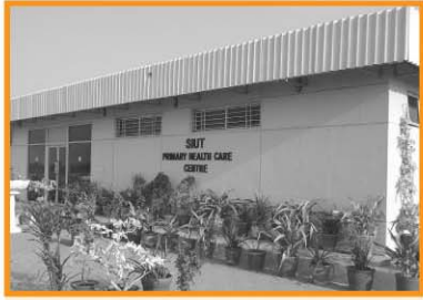
Primary Healthcare Centre Kathore, SINDH No. of Patents treated 50,000