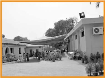
Chhablani Medical Centre Sukkur, SINDH No. of Patents treated 200,000