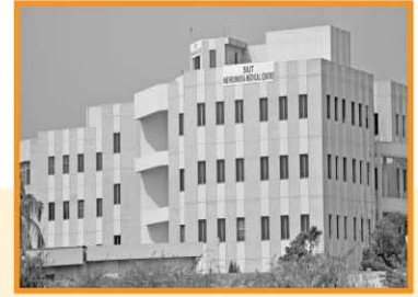
Mehrunnissa Medical Centre Korangi, Karachi, SINDH No. of Patents treated 10,000

SIUT Treats over 1 million patients a year