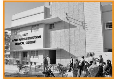
APWA Akram Khatoon Medical Centre Nazimbabad, Karachi, SINDH No. of Patents treated 10,000