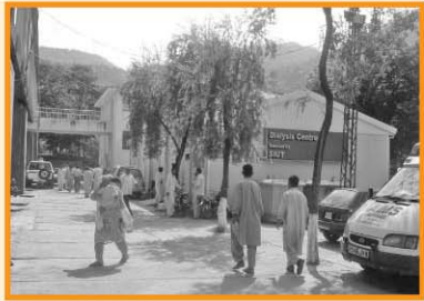
Abbas Institute of Medical Sciences Muzaffarabad, Azad Jammu Kashmir No. of Patents treated 10,000