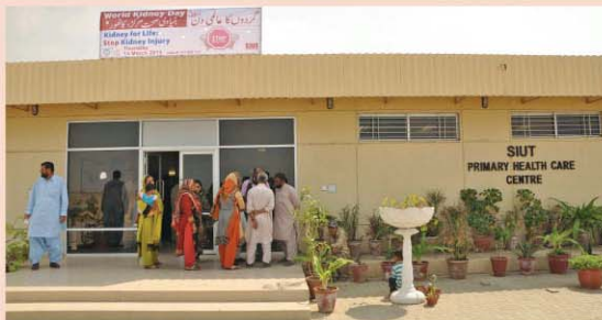
World Kidney Day at Kathore 40 k.m. from Karachi