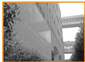
Hanifa Suleman Dawood Oncology Centre Near Civil Hospital, Karachi, SINDH No. of Patents treated 100,000