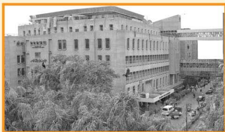
Dewan Farooq Medical Centre Near Civil Hospital, Karachi, SINDH No. of Patients treated 600,000