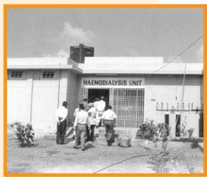
Lady Sir Abdullah Haroon Medical Centre, Cantt Bazaar Shah Faisal, Karachi, SINDH No. of Patents treated 10,000