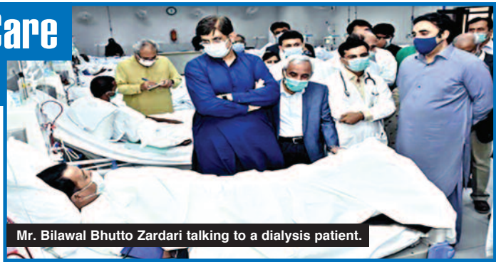
Mr. Bilawal Bhutto Zardari talking to a dialysis patient.