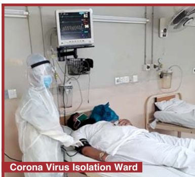
Corona Virus Isolation Ward