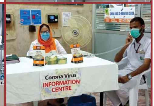
Corona Virus INFORMATION CENTRE