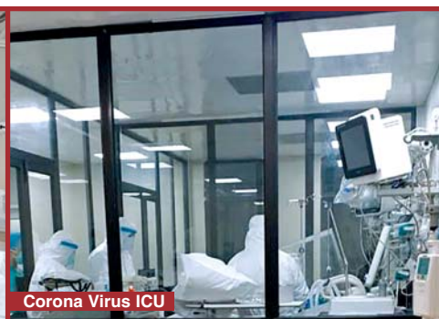
Corona Virus ICU