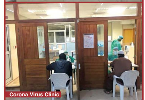
Corona Virus Clinic