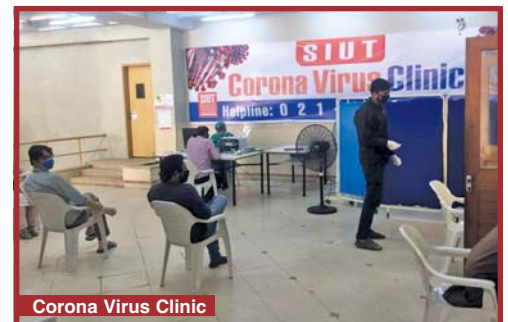
Corona Virus Clinic

SIUT established a 50 bedded Corona Isolation Ward to admit patients with non-severe symptoms and a 16 bedded Corona ICU with ventilators to treat the patients with severe disease. Before this a 6 bedded ICU was established specifically for transplant patient who being immunocompromised are at high risk of COVID-19 infection and a 8 bedded isolation ward for dialysis patient. In view of the positive patients SIUT has developed its own treatment protocol where the cost for each patient till recovery will exceed over 5 lakhs. The Corona Clinic opens daily from 8 – 11 pm, the laboratory tests samples round the clock. SIUT routine clinical services for dialysis and transplant patients continue as routine. ■