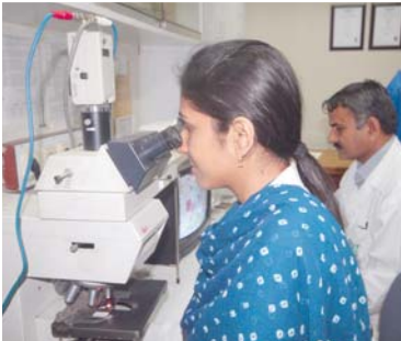
Physician Assistants at work

Opening New Doors in Technical Education -All Free with Dignity