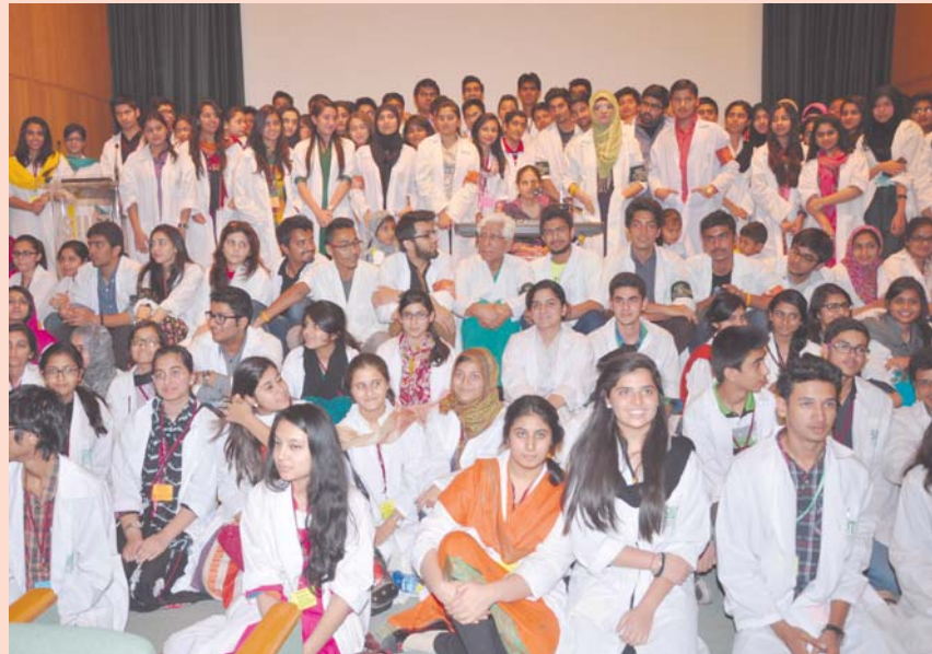
Student Volunteers of the 35th batch