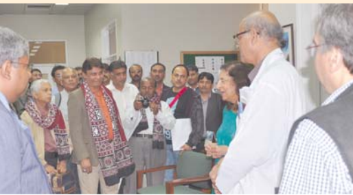
Indian Journalists visiting center of Bioethics and Culture SIUT

A group of seventeen members Indian journalists team from Kolkata Press Club visited SIUT.