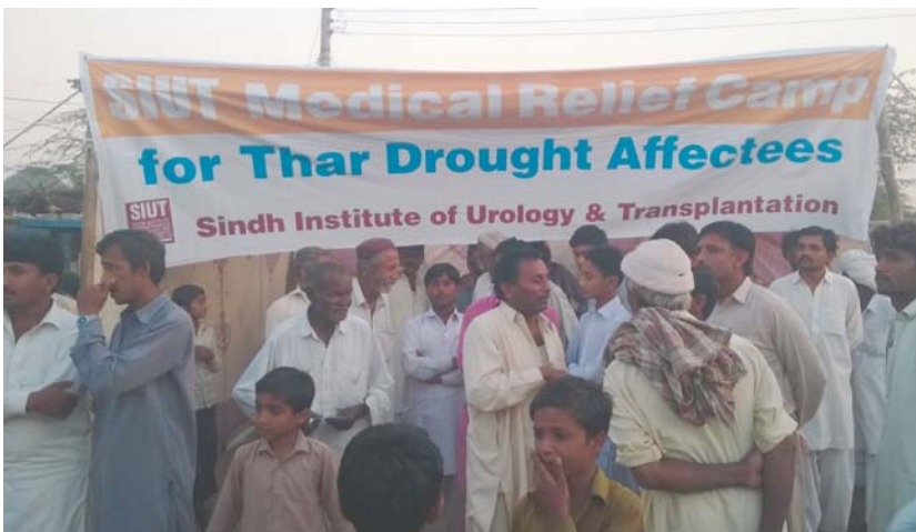
SIUT Camp at Mithi

SIUT established three medical relief camps in the drought affected area of Tharparkar district. The camps were located in Mithi district headquarter hospital beside Chilar and Islamkot. The camps were set up with the assistance of Sindh Health Department and Edhi Foundation.