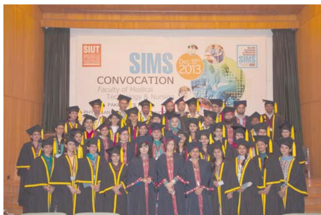
Graduates of General Nursing Specialist Nursing with Faculty

The objective of the programme is to produce highly trained and skilled personnel with a sound knowledge of medical science subjects. The programme is structured with extensive hands-on training that covers all the major fields of paramedical sciences. SIMS-SIUT does not charge any fee for admission, tuition or examinations. In other words, the education and training are free. So far 148 students have taken the degree course. Before the BS programme was launched a two-year BSc programme in collaborate with University of Karachi had produced 104 graduates from 2007 to 2010.