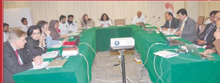
Case discussions at the workshop

They said giving the present birth rate and population of Pakistan it is estimated that one child is born every day with one of these problems.