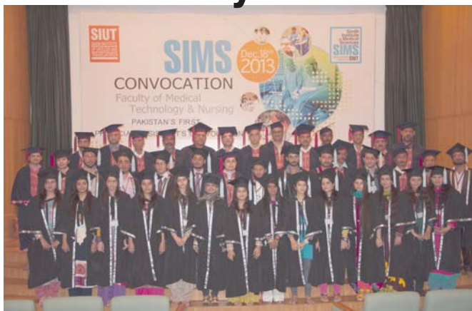
Graduates of Dialysis Sciences with Faculty