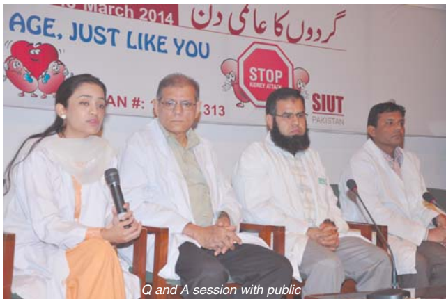
Q and A session with public

Diseases like obesity, hypertension and diabetes have been declared as the main contributing factors causing disorders of kidney.