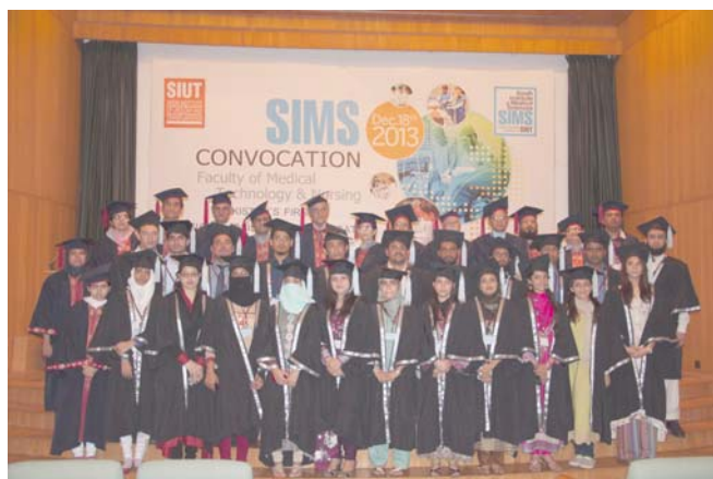
Graduates of Critical Care Sciences with Faculty