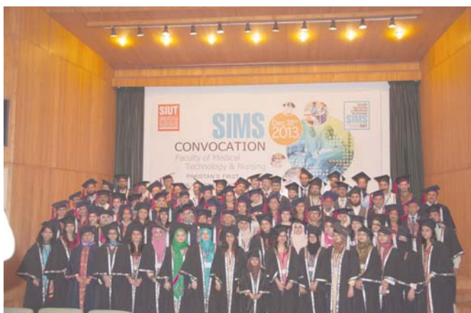
Graduates of Clinical Laboratory Sciences with Faculty