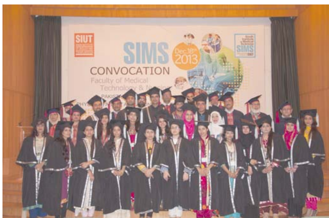
Graduates of Diagnostic Radiology with Faculty