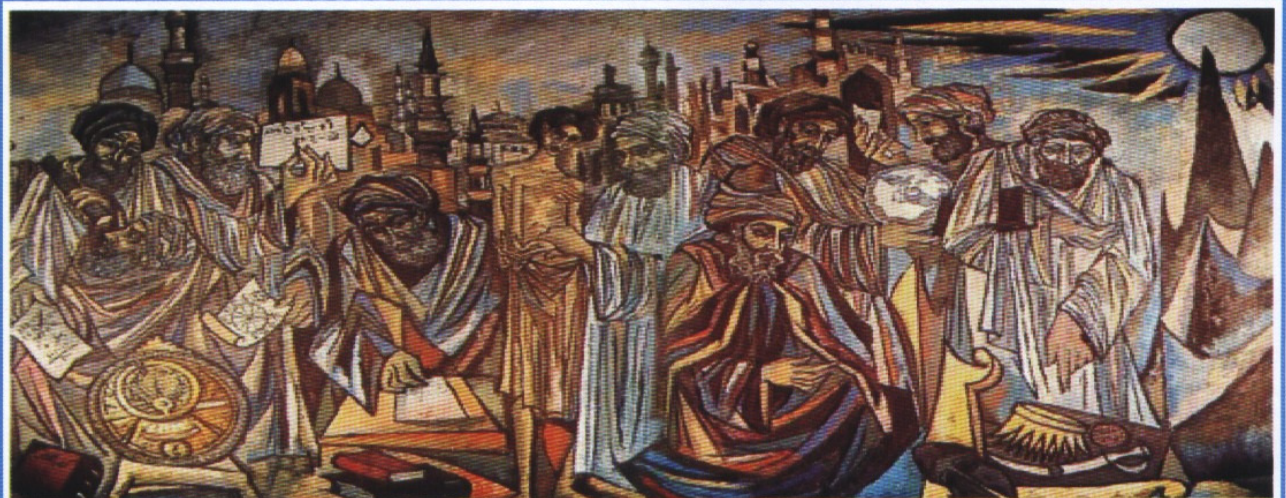
Pageant of man's intellectual advance from the times of Socrates to Einstein. Mural by Sadequain