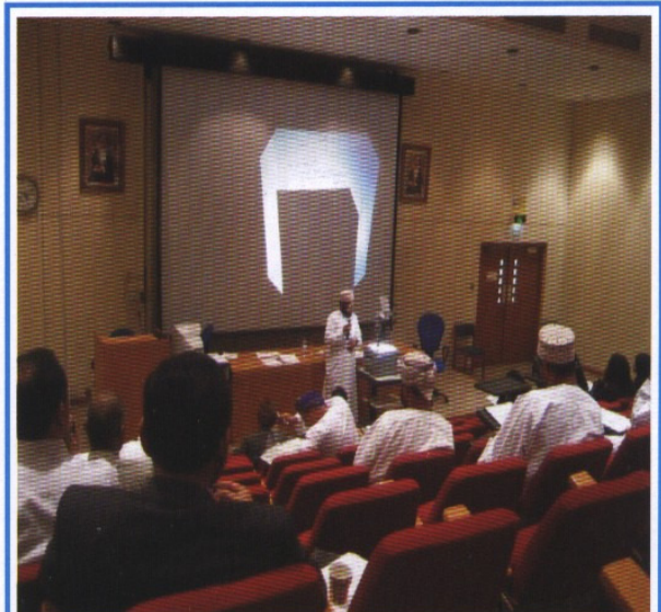
A case presentation in progress during a CBEC Workshop on Clinical Ethics in Sultan Qaboos University, Muscat, Oman in January 2007

This is the translation of an article he wrote for Medimagazine , a weekly Turkish medical magazine, and is begin re-printed here with permission.