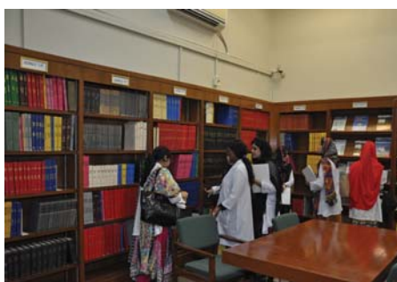
Library at Chhablani Medical Centre, Sukkur