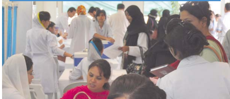
First dose of Hepatitis B vaccine was given to the attendees.

Hepatitis B and C affects 500 million people, leading to chronic liver disease and complications. Nearly 1.5 million people every year die because of hepatitis worldwide. In Pakistan, 10.25 million people are harboring either hepatitis B or C virus that is 1 in every 13 person is infected.