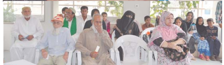
People waiting for their turn